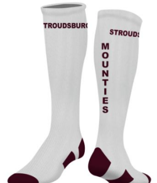
White with Maroon writing

We have five sizes (Y,S,M,L,XL). The socks are unisex with a size conversion chart to help chose the right size: