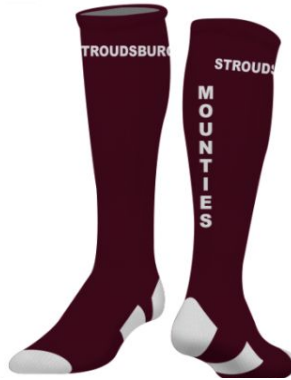
Maroon with White writing